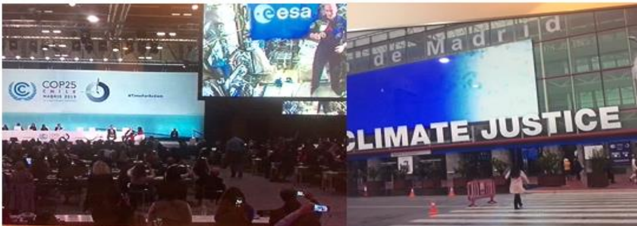
Figure 2: The Conference Setting

Next meeting of COP (COP26) was planned to take place in Scotland in 2020. Any new developments will be reported in the next up-date.