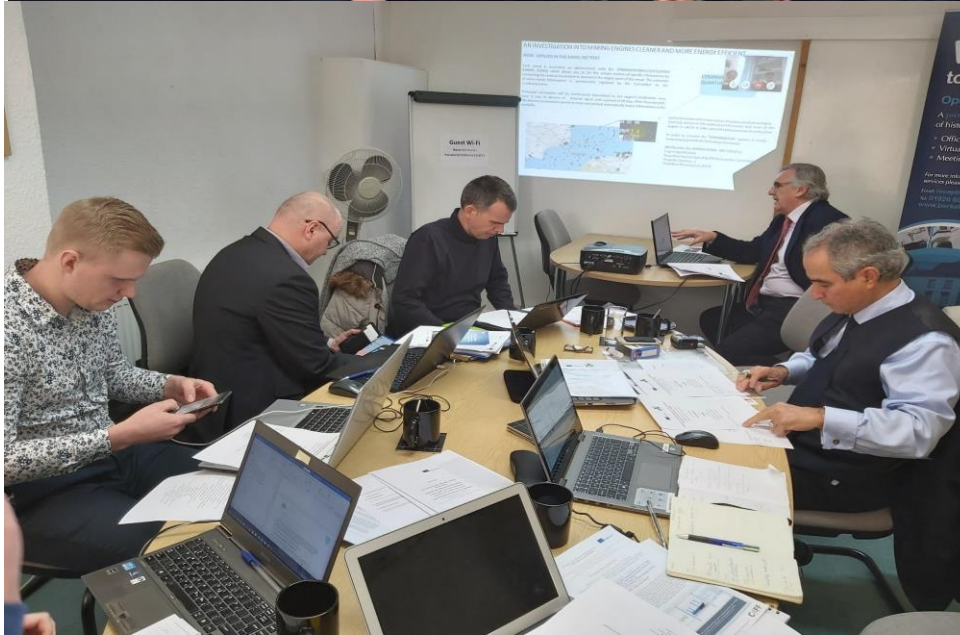
Figure 5 and 6 (above) is of the partner meetings based at Berkeley House.