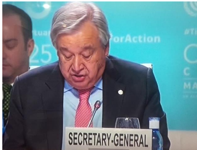
Figure 1: The Secretary General

25 is a moment to ensure they are aware of the 2020 calendar and start doing their homework. Below is figure 2 which shows some photos of the inside and outside of the conference and figure 1 is the Secretary-General expressing his views on the matter.