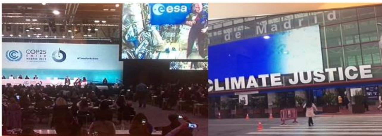
Figure 2: The Conference Setting