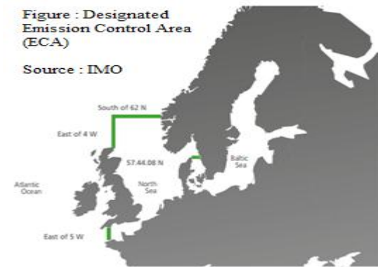
Figure 2. Tier I-II-III requirements and Designated Emission Control Area (ECA)

According to IMO, there has been a tenfold increase in the number of vessels using the Northern Sea route during recent years, with 46 ships recorded in 2012, compared with 34 in 2011 and only four in 2010.