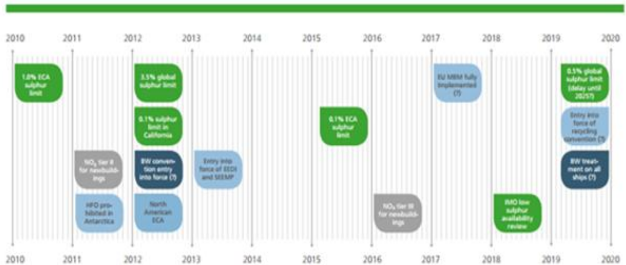
Figure 1: Upcoming maritime regulations

At MEPC 63 in March 2012, the IMO Guidelines relating to these Regulations were adopted under the following resolutions: