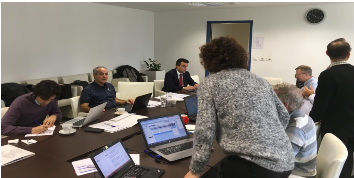
#Mentor4WBL@EU project Meeting, Athens "4 th December 2018