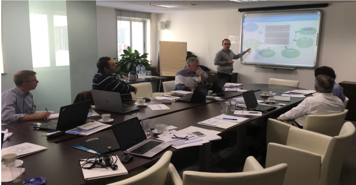
#Mentor4WBL@EU project Meeting, Athens "3 rd December 2018