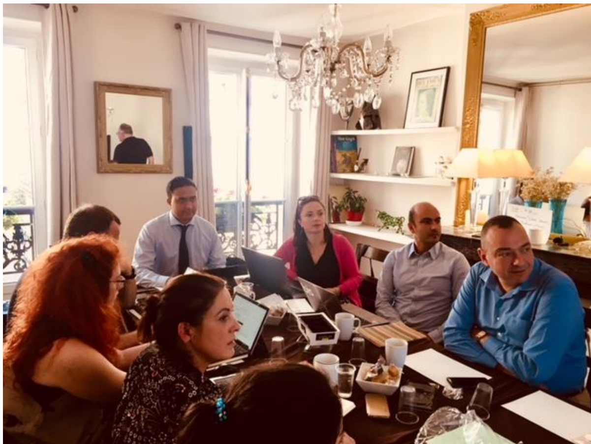
Career Comeback Support Program for Women (CCSP-W) France 18-19 October 2018.

As discussed the Paris meeting, the partners have completed the peer review of curriculum and material produced for the web portal. The curriculum is designed to primarily provide the support and confidence that women returnees need to achieve their career goals. The details of the curriculum is discussed with the partners and target group. The proposed structure of the curriculum is in two sections: