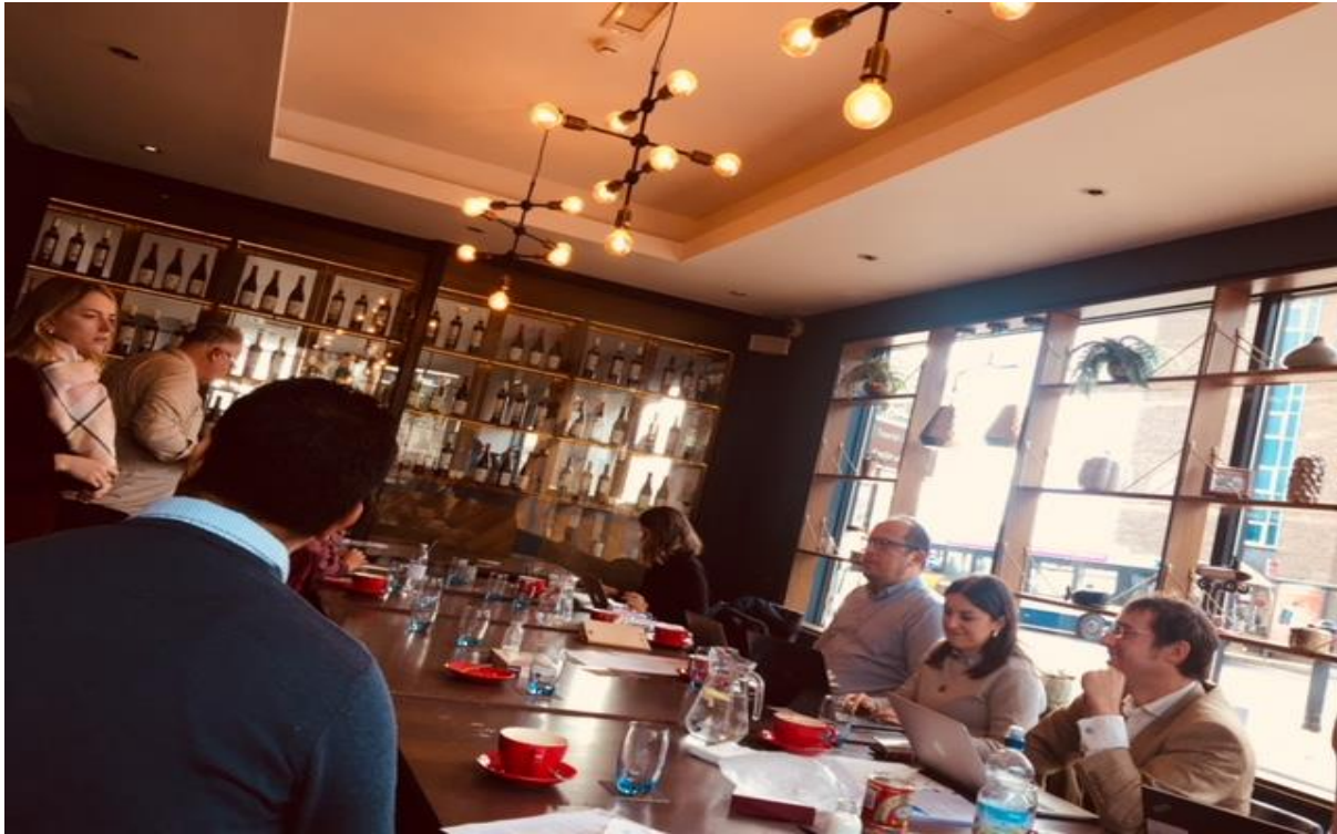
UniBus Project Partner meeting in Kenilworth