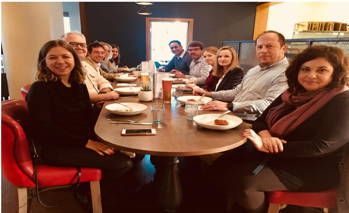
UniBus Project Partner meeting at C4FF, Kenilworth

The partners have produced the initial draft of UniBus Platform and its services and now finalising the architectural design to develop the cloud platform. This cloud platform is based on S-o-Architecture and will support the services proposed in UniBus Concept. The architecture provides horizontal services (knowledge search engine, data persistence, etc) and vertical services (collaboration project management: service to support definition of