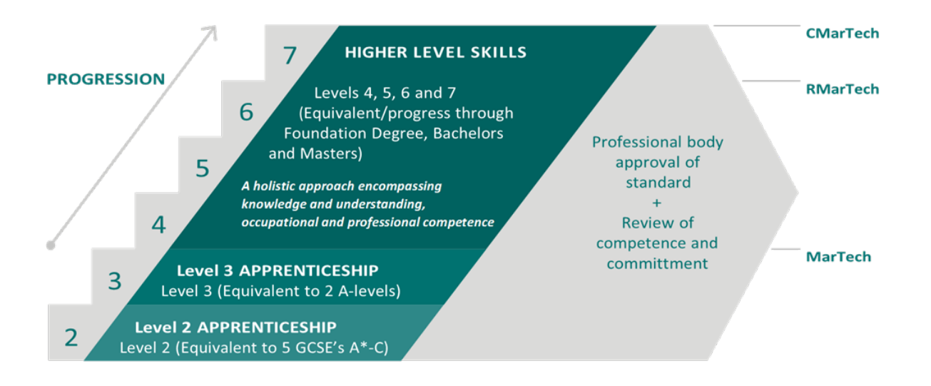
The Challenges for the Engineering Institution

The following diagram, courtesy of IMarEST, clearly shows the skill levels normally college and university students are engaged in. Some start from level 2 to higher levels right up to higher level skills including PhDs. It is important to keep contact with all students throughout their study a structure way and involve them in professional engineering activities such as accreditation, STEM, Future Engineering, Primary Engineer and so forth.