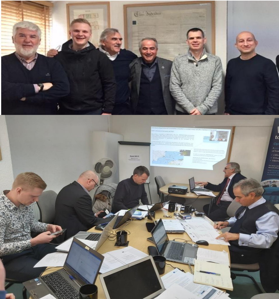
Figure 5 and 6 (above) is of the partner meetings based at C4FF, Berkeley House

The Satakunta University of Applied Sciences (SAMK) has organised an online event on Towards Zero Emissions on Thursday 29 October 2020 at 10.00–13.00. For more information click here