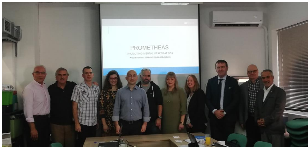
Prometheas Project team from Poland, UK, Greece, Finland, Spain and Slovenia