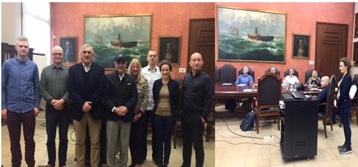
GreenShip Project Team from Spain, UK, Finland, Italy, Greece and Slovenia

This an Erasmus+ project started in October 2019 when the details were published in MariFuture. The kick-off meeting took place in Barcelona on 9-11 December 2019.