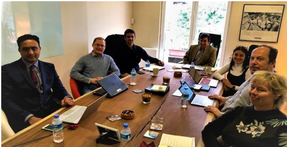
The Project Team from UK, two organisations from Finland, Turkey and Portugal