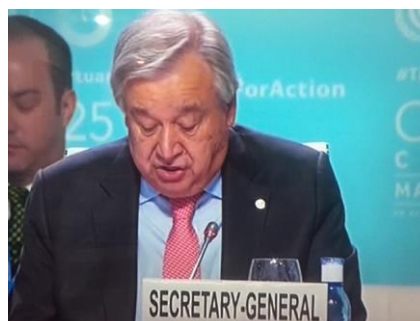
Figure 1: The Secretary General