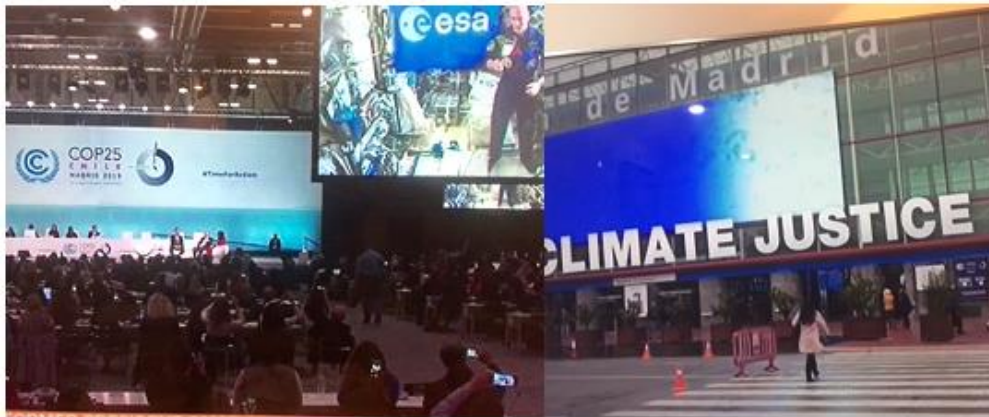
Figure 2: The Conference Setting