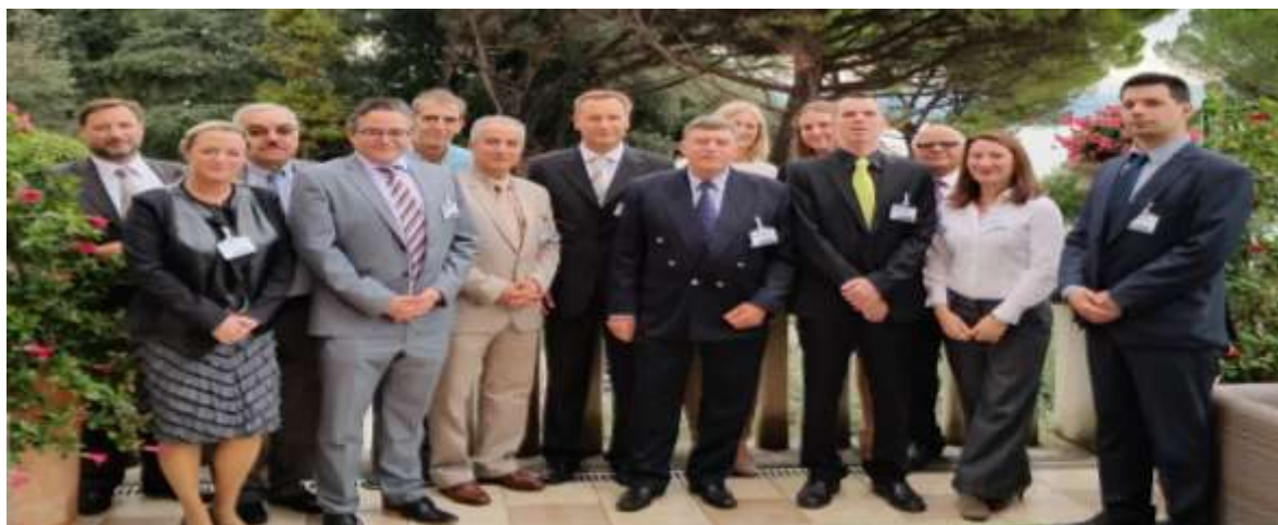
Figure 1 - Project Partners of the ACTs project

The ACTs final conference took place as part of the International Association of Maritime Universities (IAMU) General Assembly. Presenting ACTs at IAMU provided the opportunity to meet colleagues attending the IAMU Assembly and to seek their feedback on the ACTs project outcomes. Student member representatives of IAMU (IAMUS) also attended the ACTs final conference which provided a golden opportunity to find out their views on the ACTs online course design, content, assessment strategy and delivery method.