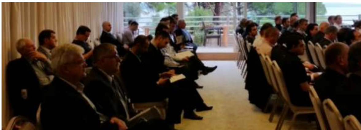
Figure 3 - Members of the IAMU participating in ACTs final conference