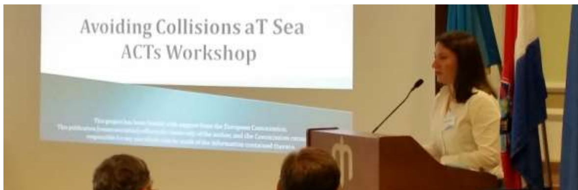
Figure 6 - Tina Matovina representative of Croatian National Agency presenting the ACTs project to participant at the ACTs final conference