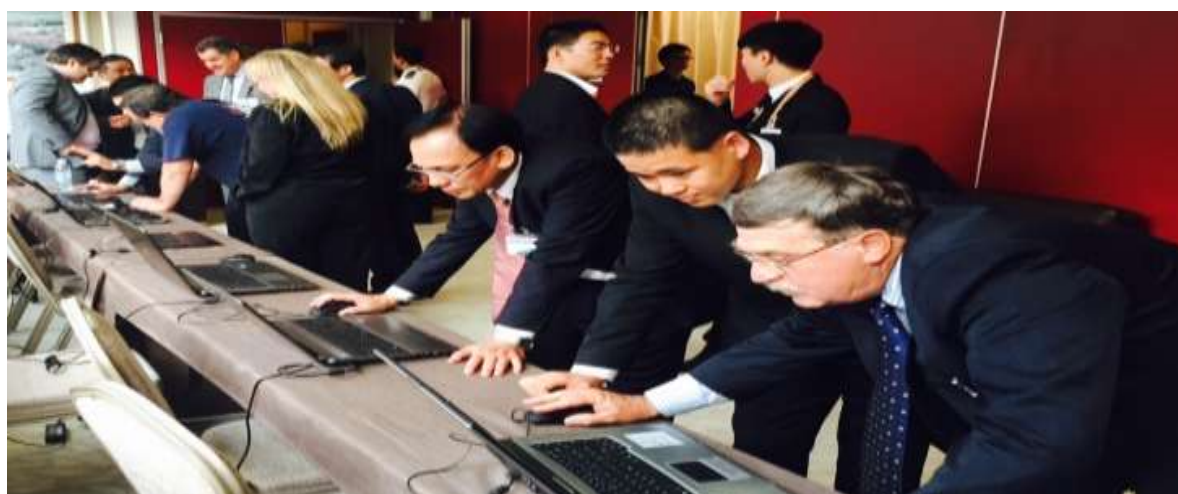
Figure 7 - Representation of Maritime Community exploring the capability of ACTs online eCOLREGS