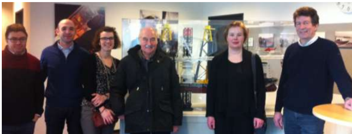
Figure 10 – MariePRO Partners in Germany