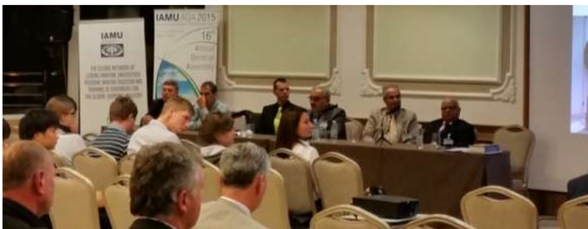
Figure 4 - Panel discussion at IAMU, ACTs final conference