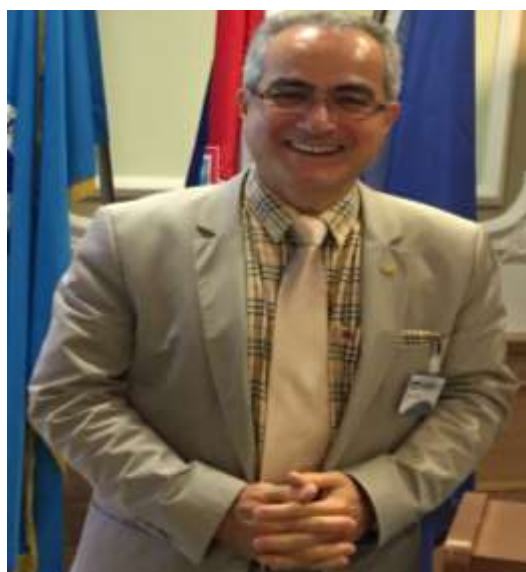
Figure 2 - Professor Ziarati presenting at the IAMU, ACTS final conference