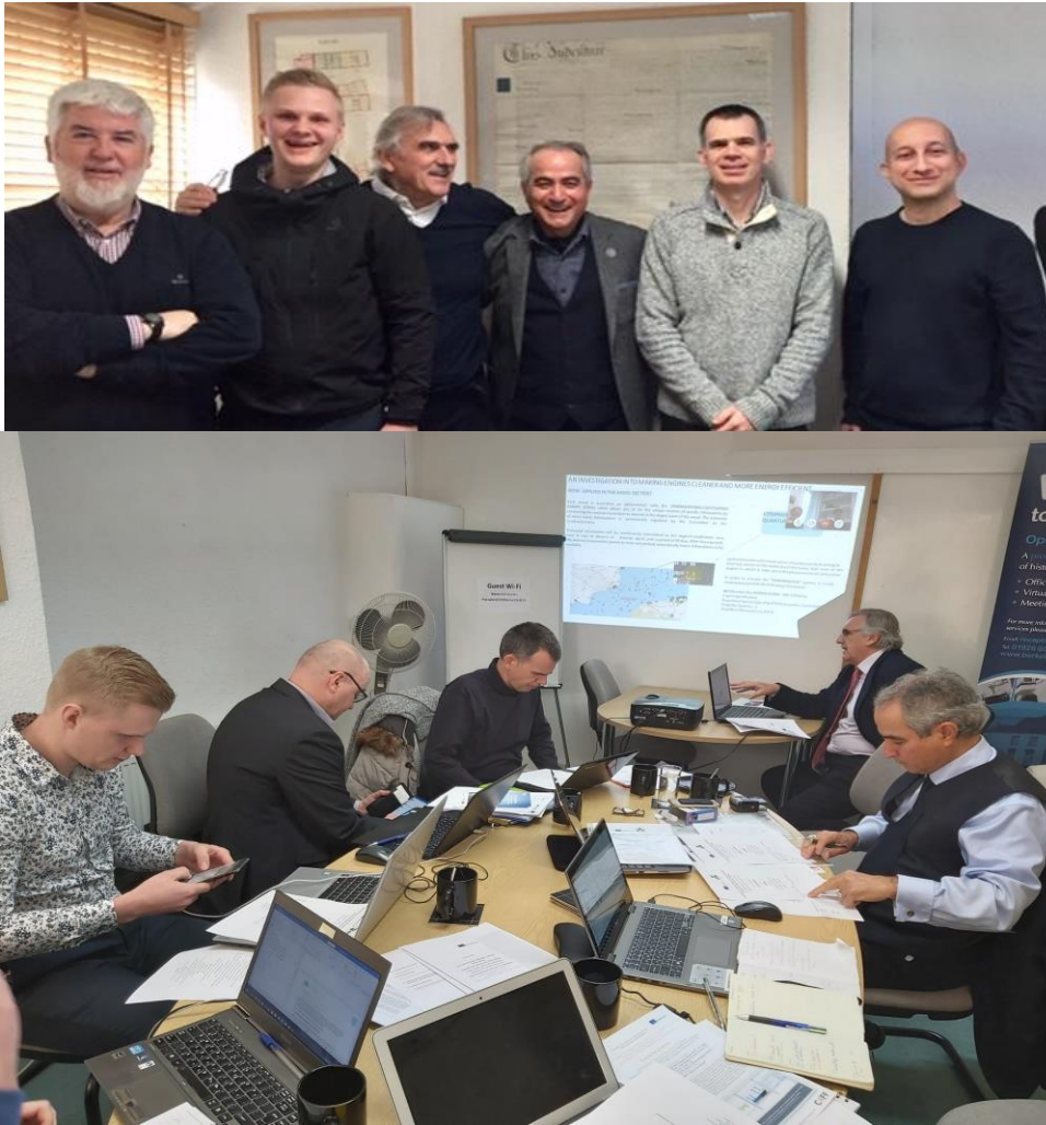
Figure 5 and 6 (above) is of the partner meetings based at Berkeley House.

The Satakunta University of Applied Sciences (SAMK) has organised an online event on Towards Zero Emissions on Thursday 29 October 2020 at 10.00–13.00. For more information click here